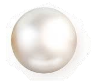
Celebration, Worship, and Communion Service Ninth Sunday after Pentecost July 30, 2023